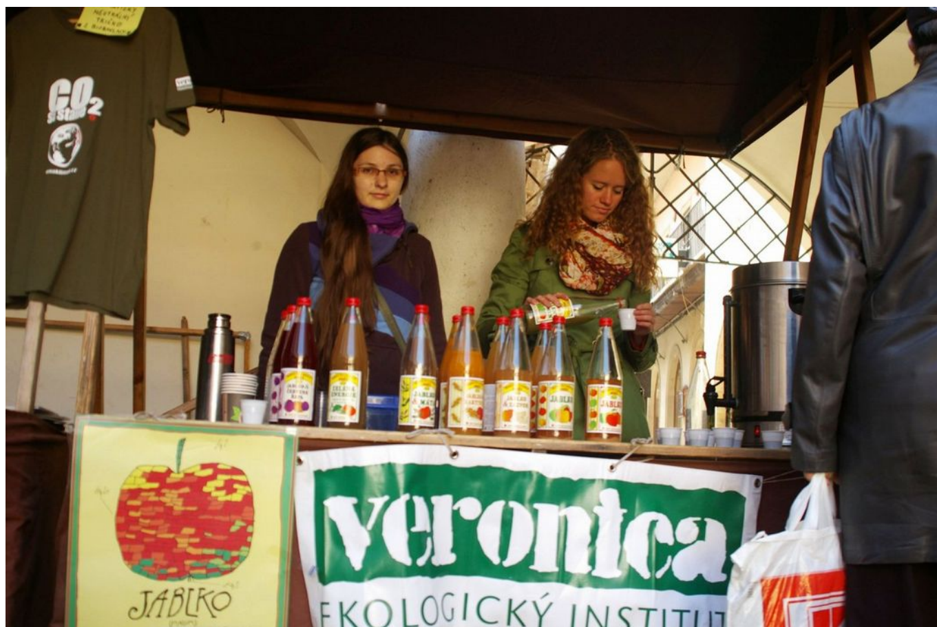
Students-interns at the Brno Organic Market

In collaboration with Department of Environmental Studies at Masaryk University and thanks to project “International network for Policy Development in Sustainable Development” were prepared traineeships for master students of Environmental studies field. Students were actively involved into the operations of the organization and participated in various activities of non-profit organizations and it's everyday running. Internship contained theory and practice and was held in Brno and Hostětín. Students had an opportunity to participate and work on topics of nature protection, climate protection, ecological counselling, project management or administration and editorial activities of Veronica magazine. Other students did an internship specialized on fruit planting.